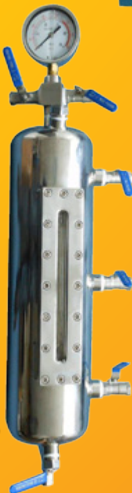
Mosherflo Seal Pot